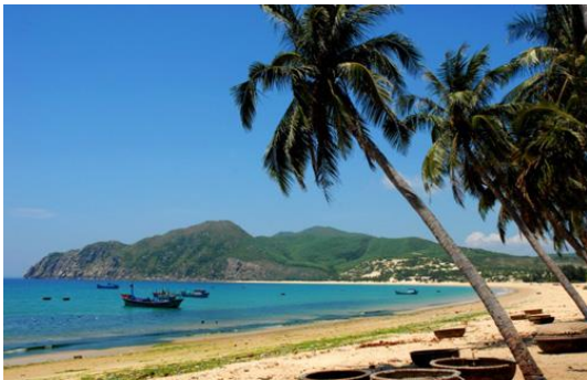
Figure 4. Long Thuy beach

Tuy Hoa city has a coastline of over 15km long. The coast with many clean and beautiful beaches with fine golden sand, clear blue sea water, and beautiful sunshine is also a tourist attraction. The romantic beaches such as Long Thuy, Tuy Hoa, April 1 beach, Phu Lam beach, tourism on Hon Dua island, Hon Than, Hon Chua ... are convenient for developing resort tourism, swimming and sport with fully meets the criteria of 3S (Sea, Sun, Sand) (Figure 4, 5).