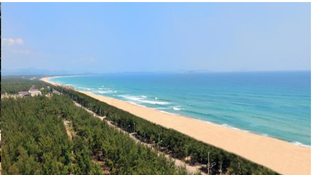
Figure 5. Tuy Hoa beach