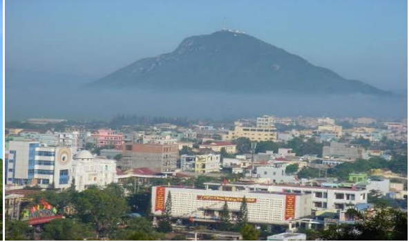
Figure 3. Chop Chai mountain and Tuy Hoa City