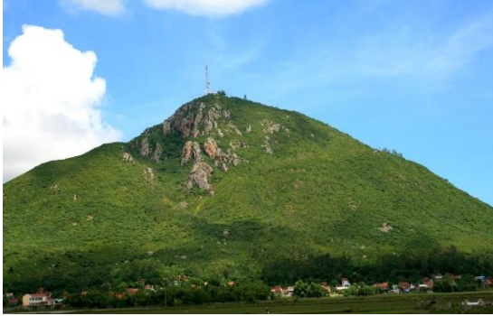
Figure 2. Chop Chai mountain