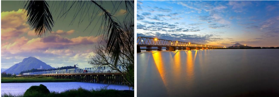
Figure 6. Rang Bridge crossing Ba River

Nhan mountain, Ba river, it creates a unique landscape. The bridge is considered one of the symbols of Phu Yen, Tuy Hoa (Figure 6).