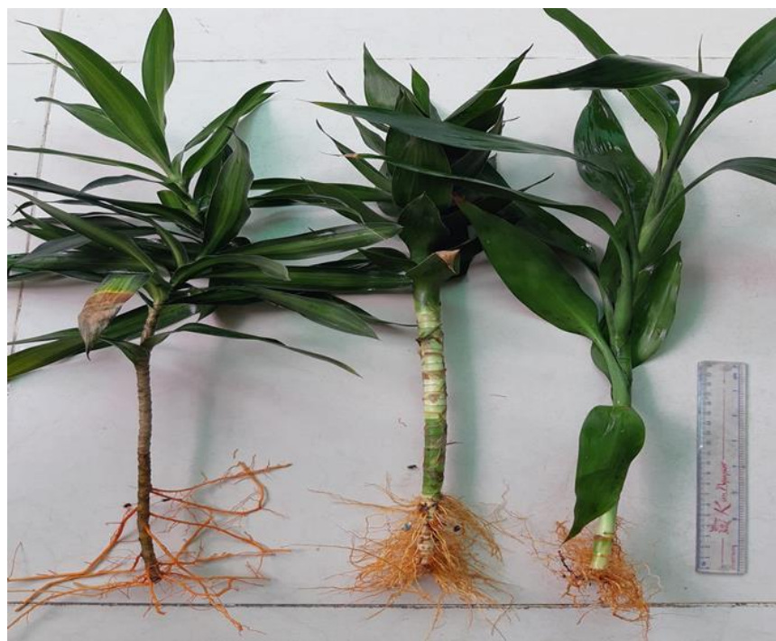
Figure 1. Photograph of the experimental plants ( D. reflex , D. deremensis , D. sanderiana – from left to right)

Experiment: The experiments were performed in 45 \times 32 \times 20 cm containers, each filled with 15 L of tap water containing concentrations of Pb 100mg/L [ \text{Pb}(\text{NO}_3)_2 , Sigma–Aldrich]. Each container included five plants that were evenly distributed and suspended in the solution by means of a plastic bar around the stem through a perforated lid. All the treatments were performed for 30 days. The initial solution pH was approximately 4.5 (selected based on our preliminary data and Fischer et al., 2016) and was not adjusted throughout this experiment. The plants that were not exposed to Pb were maintained alongside those of each experimental group and served as controls. The experiment was carried out in the research greenhouse, at Thu Dau Mot University, Binh Duong Province, Vietnam. The average relative humidity of the greenhouse was 60% and the dark and light average temperatures were 28^\circ\text{C} and 34^\circ\text{C} respectively.